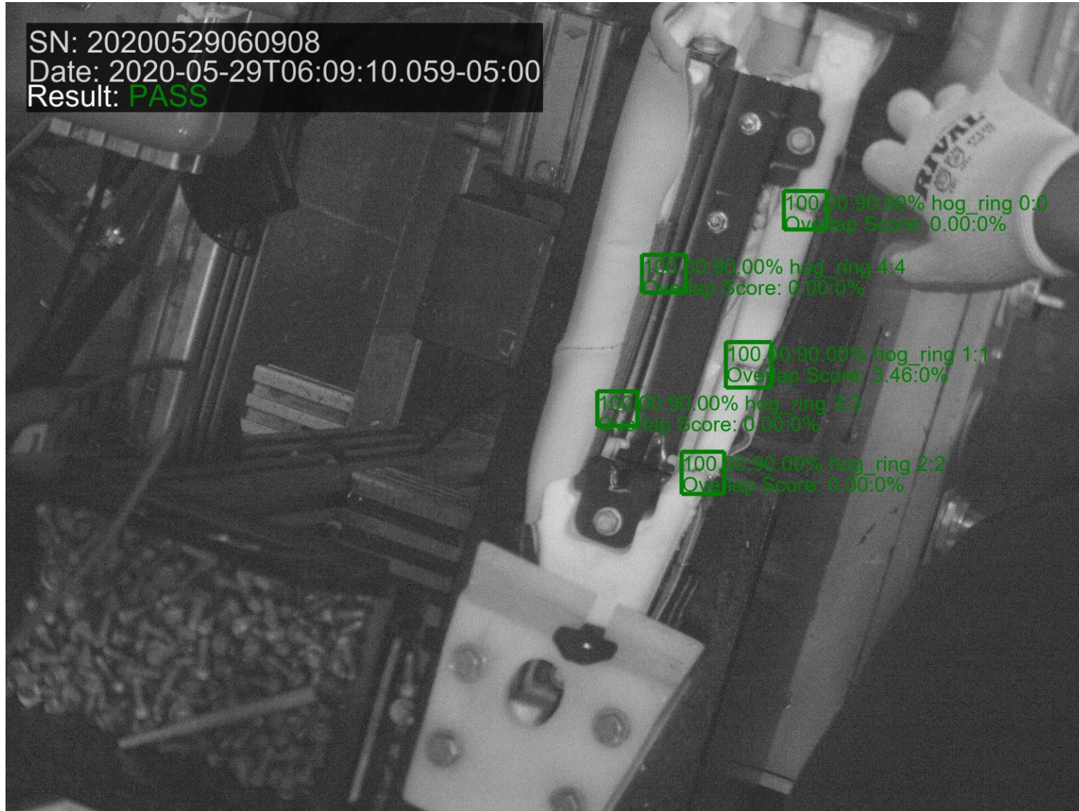
Same detection, lighter colored cover

SN: 20200529060908 Date: 2020-05-29T06:09:10.059-05:00 Result: PASS