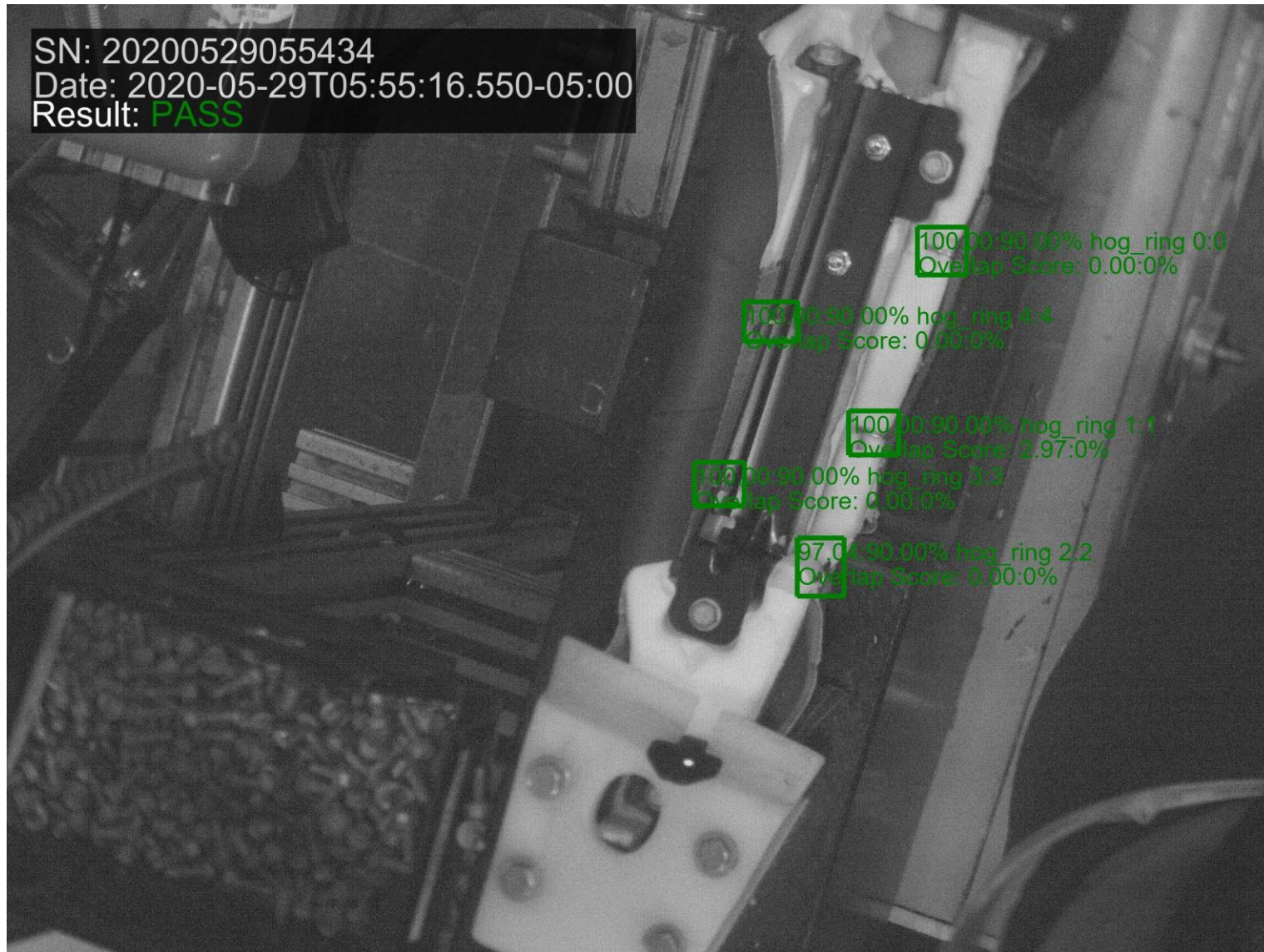
5 hog rings to hold cover over arm rest console. Notice the black material in this one